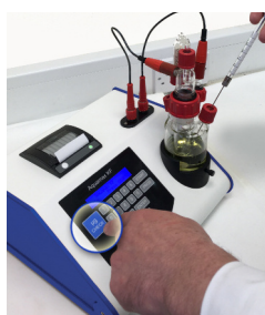
Water check button and syringe

The ug check button allows the operator to simply press go, inject 1ul or maybe 10ul of distilled water (as required by some ASTM methods) and verify if the instrument and reagent are working with in their required specification. The ug check overrides the programmed calculation and displays/prints out a report of the verification check. The coulometer then automatically reverts back to the pre-programmed setting.